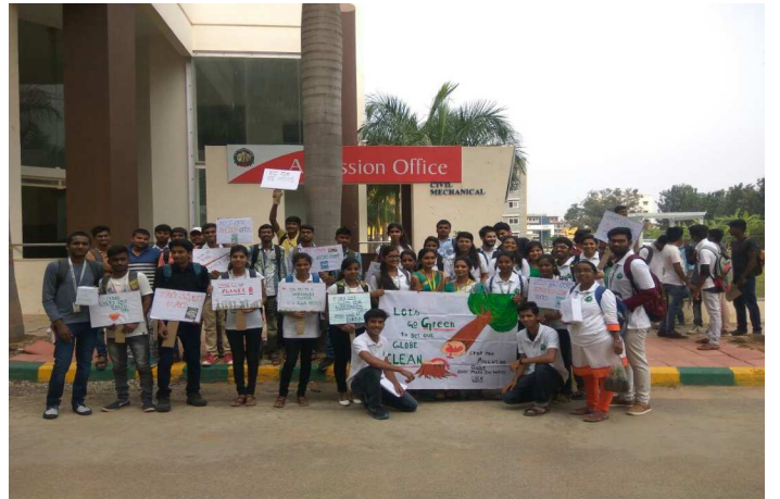
GREEN CLUB EVENT