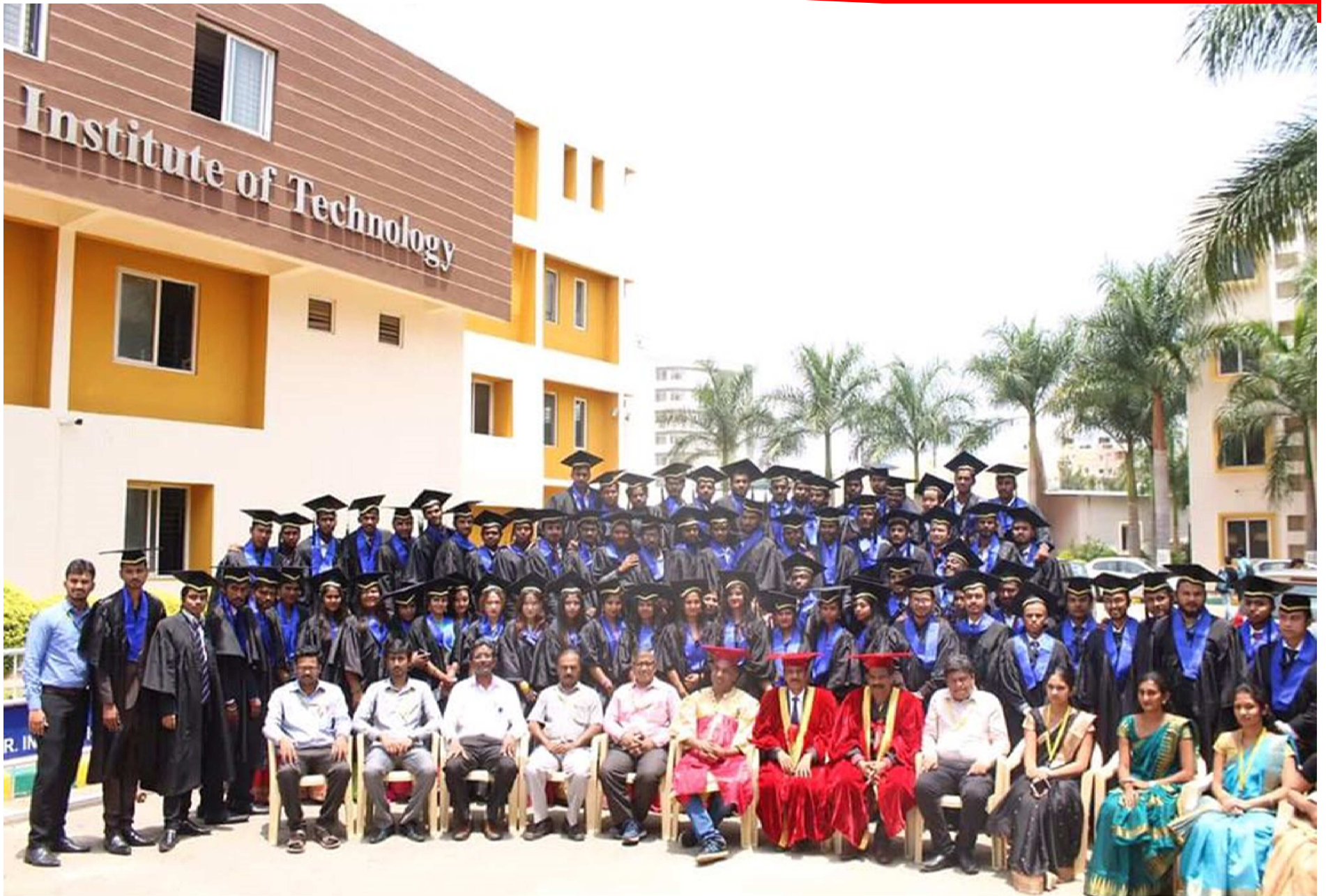
Graduation Day 2017-18