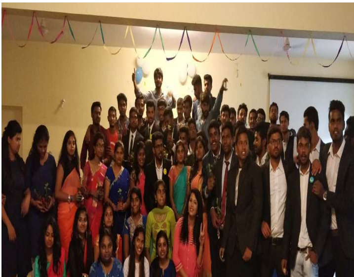
FARE WELL DAY